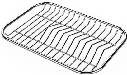
Stainless steel plate rack only usable in combination with the accessories 8644 003 8100 154