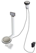
Space Light automatic waste fitting - PL 8407 117